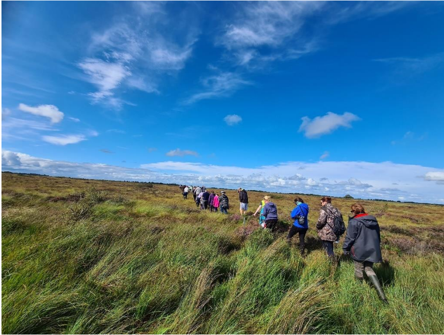
Project open day - August 2021