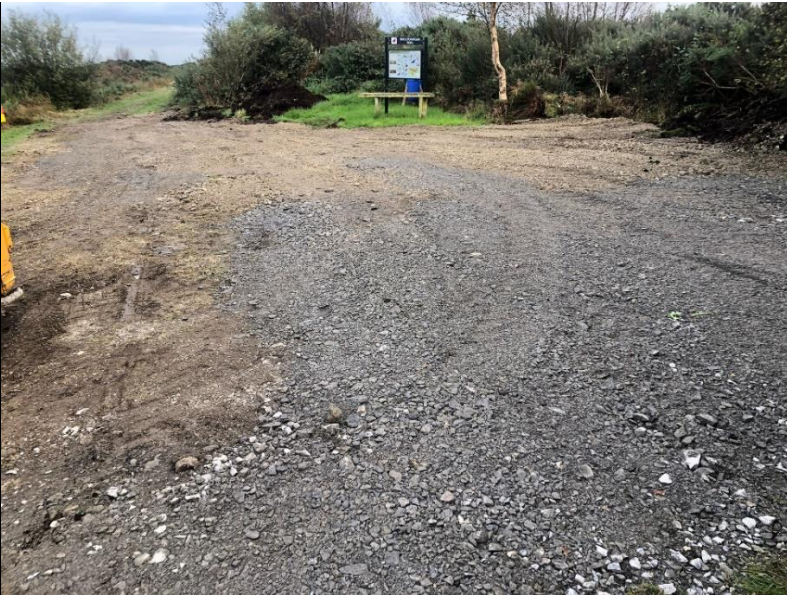
Work in progress