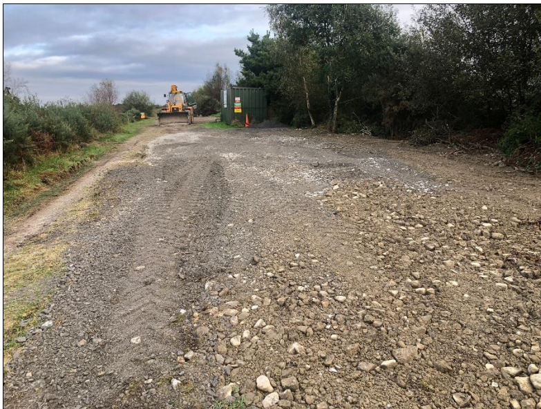
Works in progress

This extension involved the remaking of the existing hard surface area, so we can now facilitate a safe space for the parking of cars, and small buses which currently bring groups of people on site for guided events or walks.