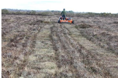
Heather strimming - February 2021

Note: Heather cannot be cut from March-September.