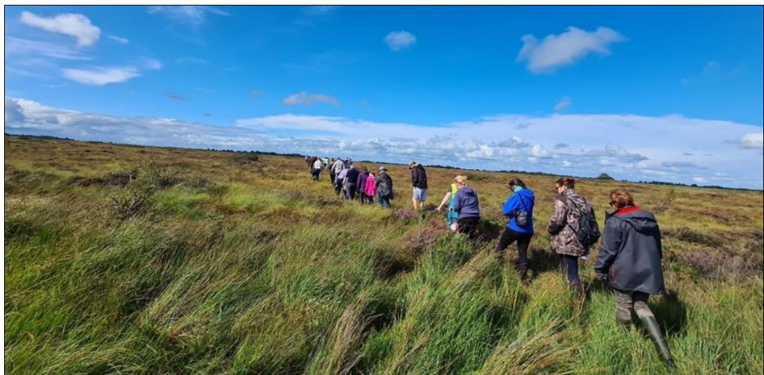
Project open day (August 2021)