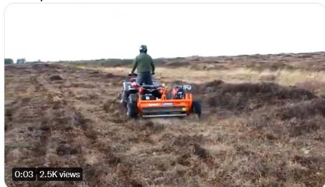
See video here: link