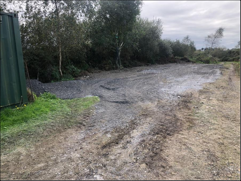
Works in progress