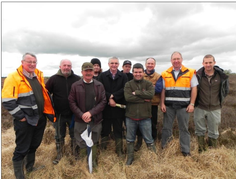
Initial meeting between project team and Bord na Móna (2009)

The original project conservation plan (2010-2015) produced by Scallan (2009) established a framework to achieve community-based conservation actions on Ballydangan Bog in a manner that supports Red Grouse, a healthy diversity and abundance of wildlife species and human uses. Moore Community Council played a key role in providing resources to implement the project's actions through a community employment scheme.