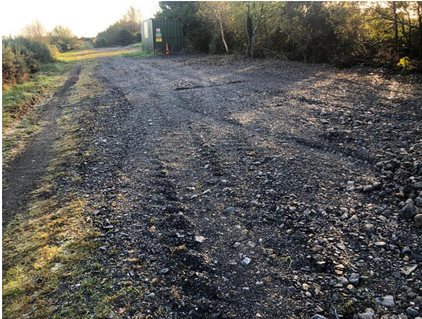
Works completed – parking access repaired and safe for vehicles (October 2021)