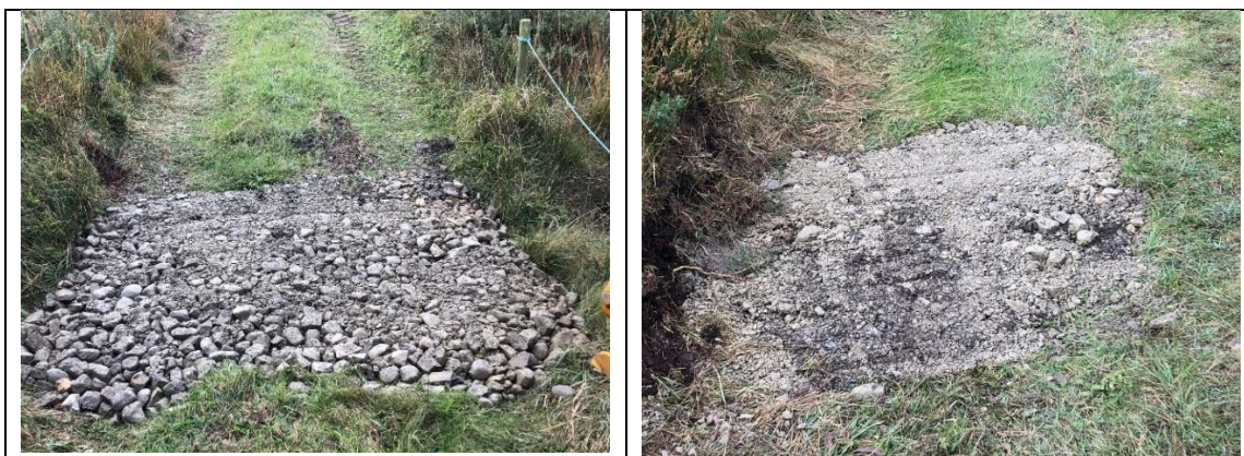
Example of completed works – walking path improvement