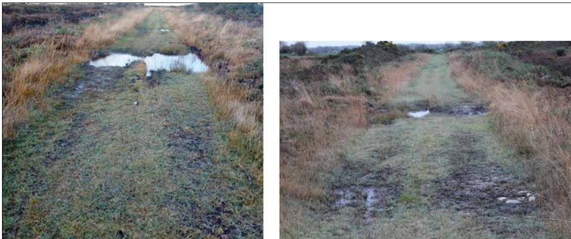
Before work took place